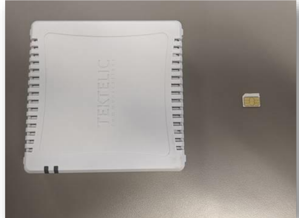
Figure 2 : Orientation of SIM Card while inserting into slot