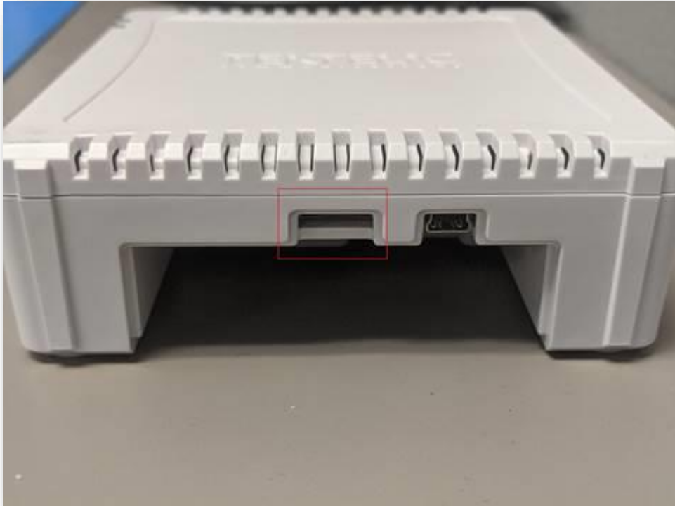
Figure 1 : SIM card slot for Kona Micro